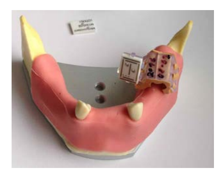
Figure 1: Developed marker fixed on an impression tray to a lower jaw model

A dual mode marker was developed with a laser engraved optical pattern composed of rectangles and circles brought to a ceramic substrate of 10x15 mm in size (Figure 1). High contrast could be guaranteed by using a specific PET-film. Two holes in the ceramic substrate ensure the clear identification of the position of the marker within the CBCT images.